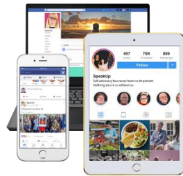
Social media / IT / gaming areas