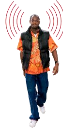
Specialist sound / loop systems