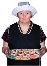
Cooking / baking.