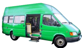
Transport and drop-off areas