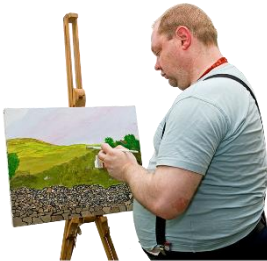
Arts and crafts