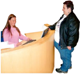
Reception / entrance