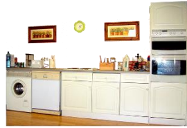
Kitchen / cooking