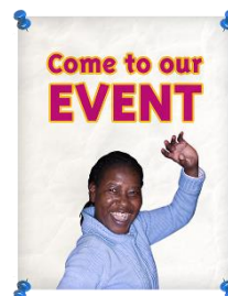
Socialising / indoor event space