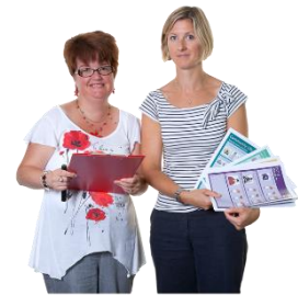
Information and advice