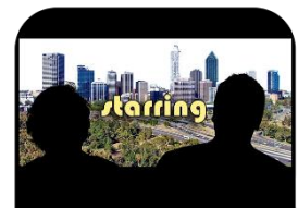
Film / cinema club