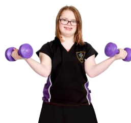
Exercise / gym