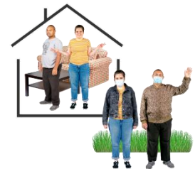
Access to outdoor areas