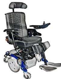
Wheelchair / equipment store