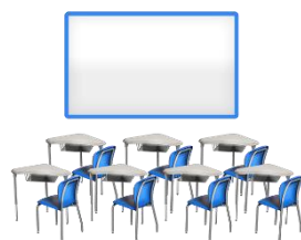
Learning new skills / training