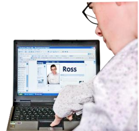
IT / web-based skills