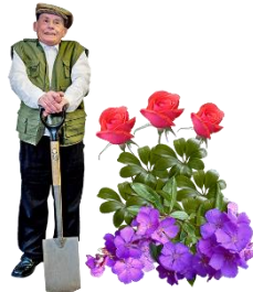
Gardening / allotment