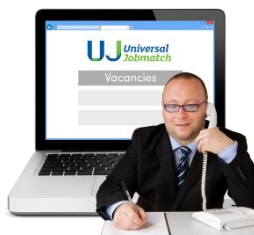
Support to get a job or volunteer