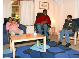
Lounge / group areas