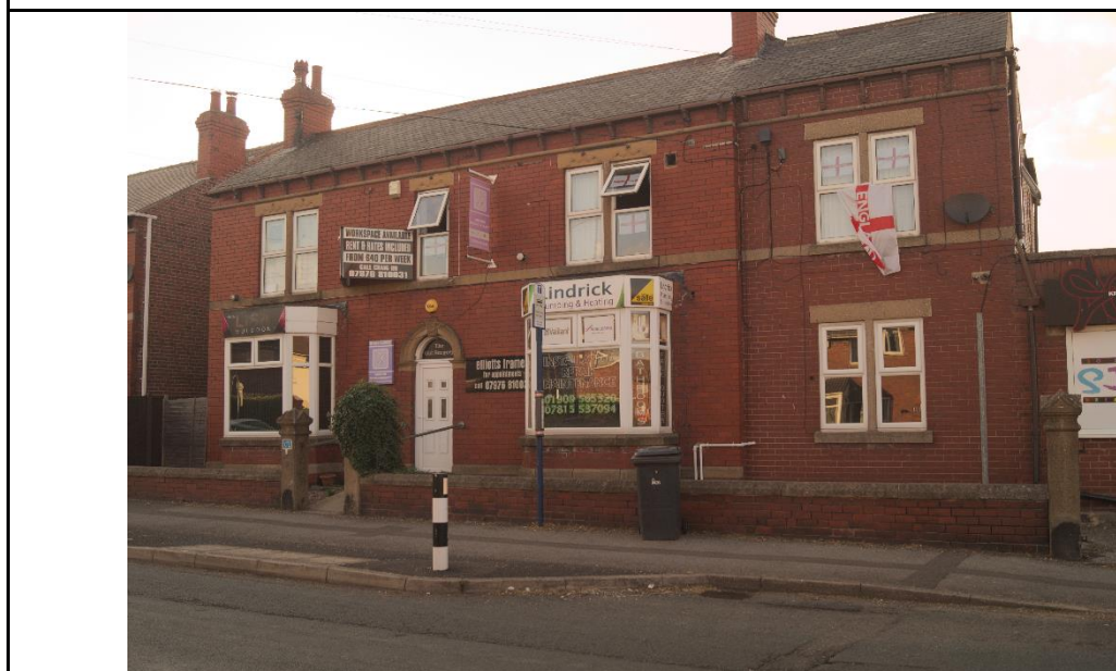
Dinnington St John's Neighbourhood Plan Supporting Evidence – Dinnington Character Buildings and Structures of Local Heritage Interest

NAME OF ASSET: 'THE OLD SURGERY' (LIDGETT LANE), 13 Lidgett Lane, S25 2QB.